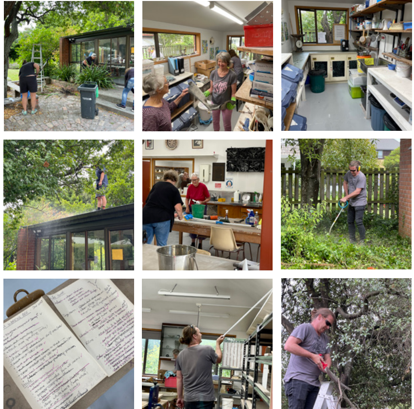
A huge thank you to all the wonderful members (and some non-members) who came for the working bee... nothing was overlooked!