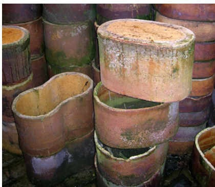
A stack of saggars

If you are interested in trying this technique, book your place on the saggar workshop (see poster on next page).