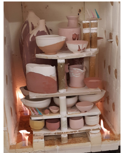
top: Loaded and ready to fire. below: The results!

If you are interested in joining the group just send an email to canterburypotters@gmail.com with the subject line - gas firing group.