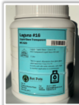
Laguna Transparent Glaze